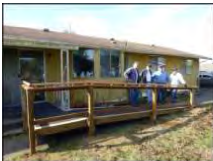
Our chapter has built over 500 ramps.