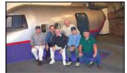
Imagine Children's Museum