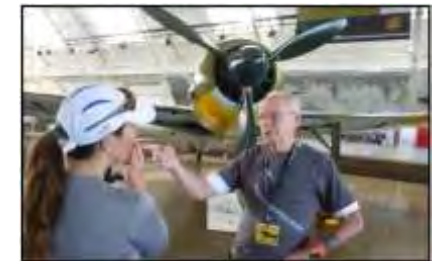
Flying Heritage Collection

Volunteer projects include distributing Christmas gifts and food to needy families, sewing quilts and clothing for various charities, repacking hundreds of science kits used in Everett school classrooms, building a play airplane for Imagine Children's Museum, providing docents for Flying Heritage Collection and many more activities.