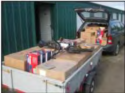
Warehousing goods from World Vision.

Our programs focus on helping the elderly and disabled by building ramps, installing grab bars and making other fall-prevention changes to their homes. We also distribute goods from World Vision, provide school supplies, and work to help the homeless and victims of domestic violence.