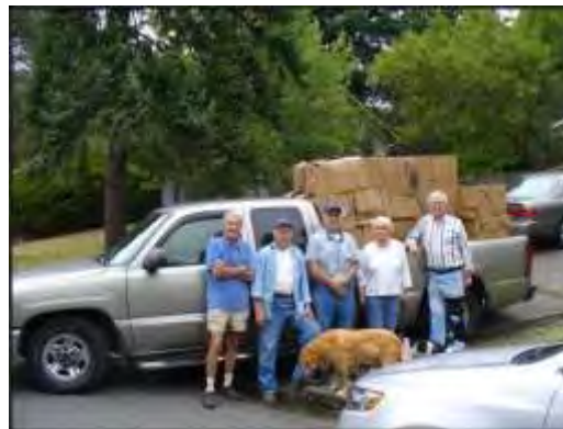
Delivering School Supplies.

Monthly chapter meetings feature interesting speakers plus other activities. A Boeing sponsored dinner is given each year to recognize individuals who have contributed substantial service.